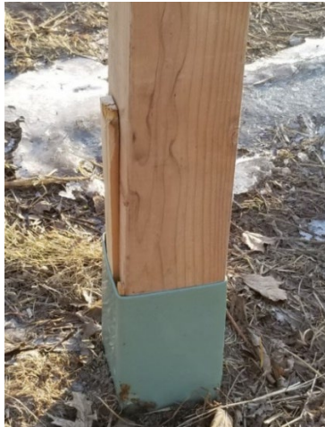
Figure 20-4. Installation of Mailbox Post.