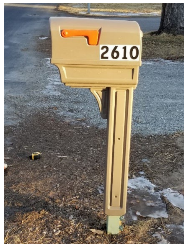
Figure 20-5. Curbside Mailbox.