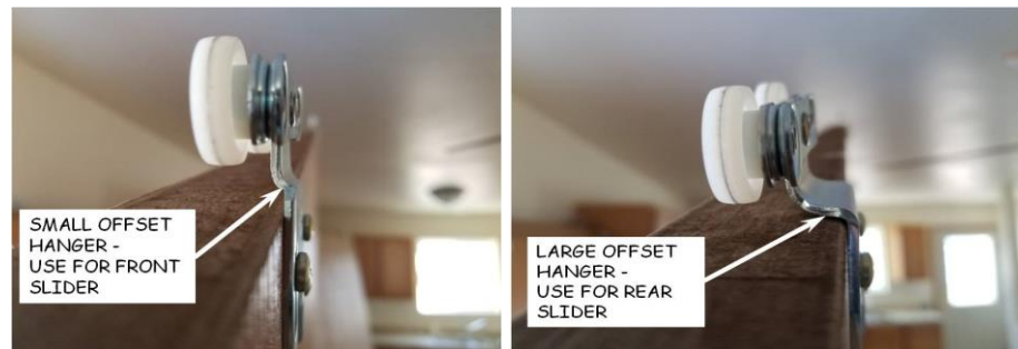
Figure 18-1. Sliding Door Hangers.

WARNING: Do not use an impact driver when installing or loosening hanger screws in this or any of the following steps.