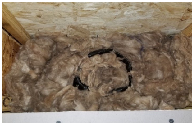
Figure 12-2. Insulation Filled Around Future Fan Vent Duct.