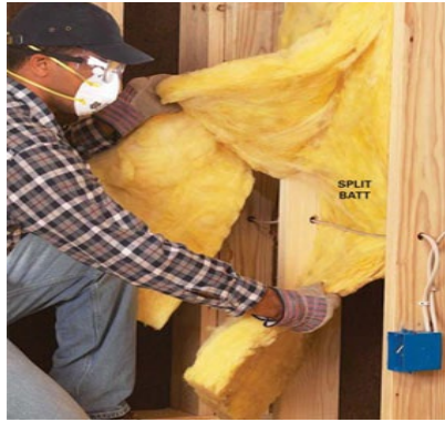
Figure 12-6. Insulating Around Electrical Wires.