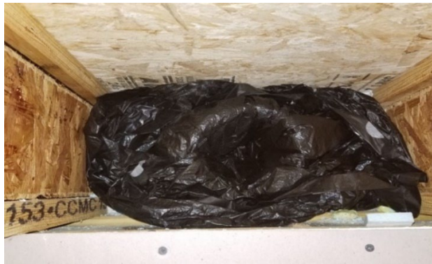
Figure 12-1. Plastic Bag Inserted Into Future Fan Vent Duct.