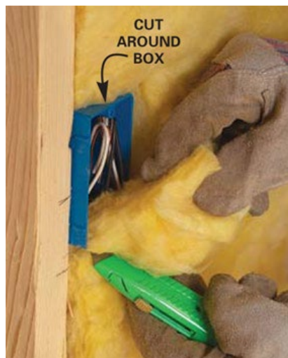
Figure 12-7. Insulating Around Electrical Box.

EXAMPLE: If the box measures 4” for the height, 3” for the width and 3” for the depth, cut out the insulation only to that size. Be sure to install insulation behind the box.