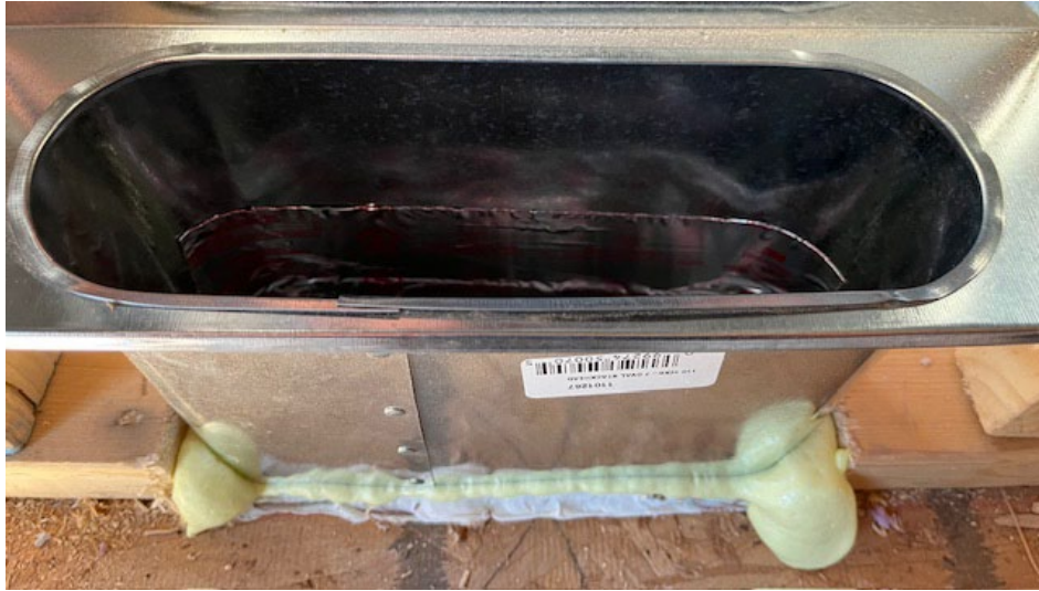
Figure 12-5. Sealing Cold Air Return Joints