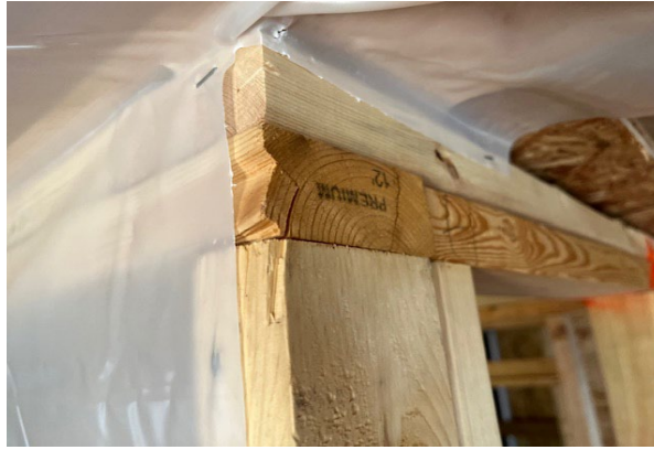
Figure 12-8. Extending Poly Around a Corner.