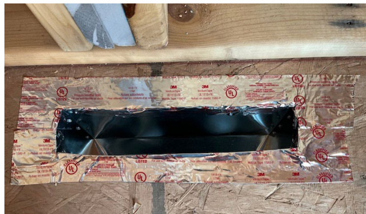
Figure 12-4. Sealing In-Floor Heating Duct.