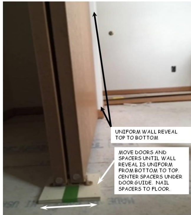
Figure 18-4. Shim Adjustment for Uniform Door Reveal.