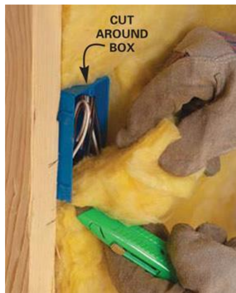
Figure 12-7. Insulating Around Electrical Box.

EXAMPLE: If the box measures 4” for the height, 3” for the width and 3” for the depth, cut out the insulation only to that size. Be sure to install insulation behind the box.